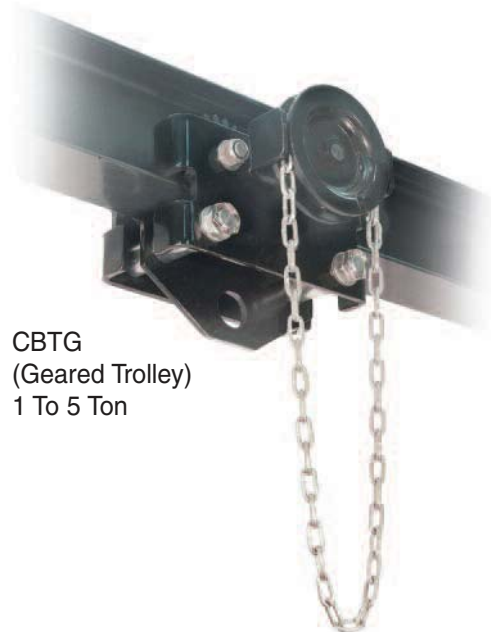
CBTG (Geared Trolley) 1 To 5 Ton