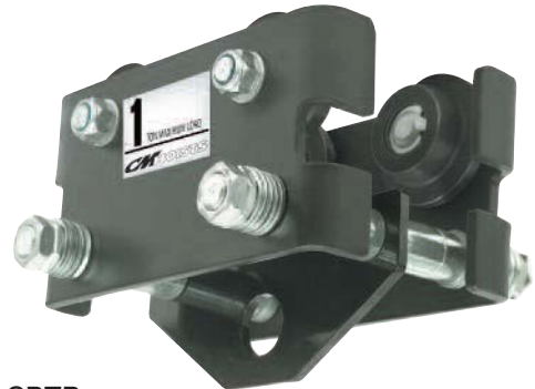
CBTP (Plain Trolley) 1/4 To 5 Ton